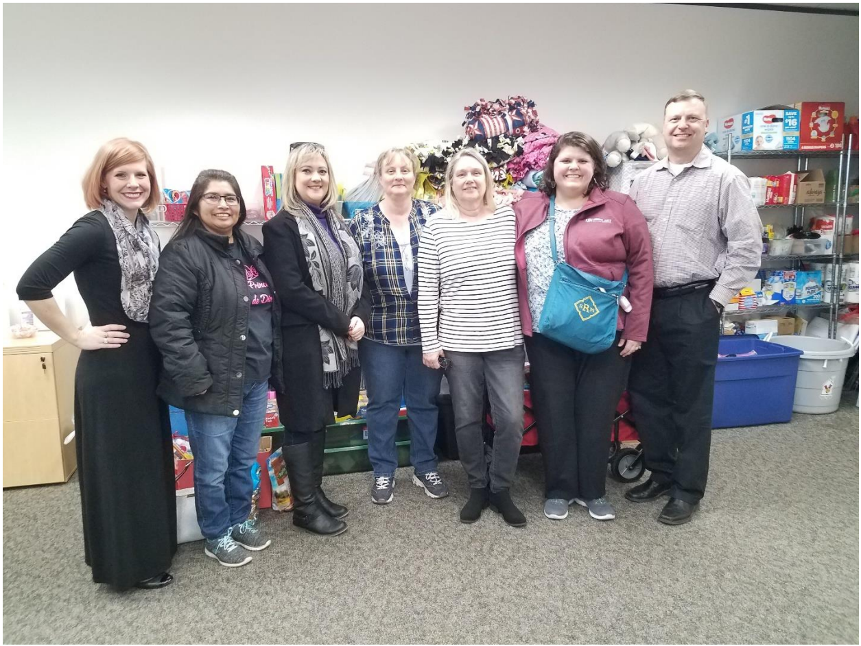
ECON staff donate items to the Central Texas Ronald McDonald House on 6 March, 2019.